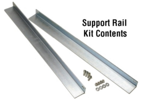
Support Rail Kit Contents