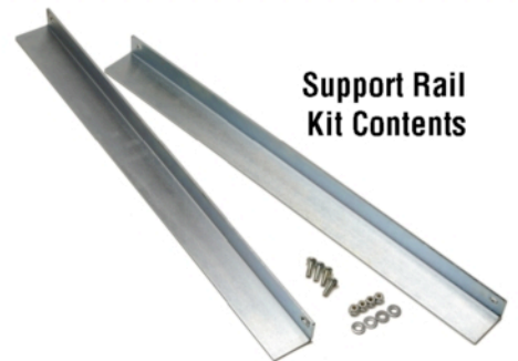
Support Rail Kit Contents