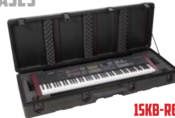
1SKB-R6020W Roto-Molded 88-Note Keyboard Case