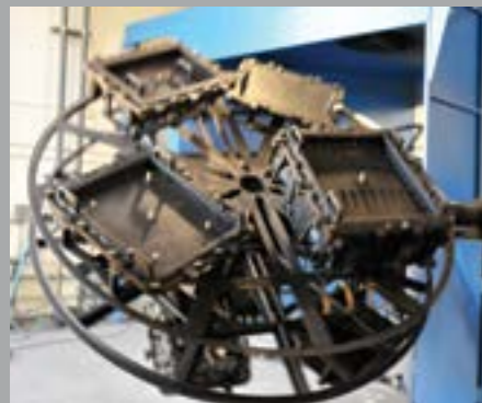
Molds rotating during production

This is SKB's latest venture in our quest to provide the most innovative hard shell case products. Injection molding is an expensive investment and there is no room for error. Made with extreme pressure, even the smallest injection molded part requires a very large and heavy mold. SKB has molds that weigh almost 13.300kgs! Many of our parts, such as our patented trigger latches are produced by the injection mold process. Our iSeries cases include a gasket that makes the case water-tight and dust proof. Our latest injection molded cases for guitars and basses are very popular with touring musicians. These cases have dual lives as they are also used for military weapons. Never before has an ATA flight case been so lightweight, yet so advanced.