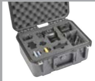
Photo & Video Cases