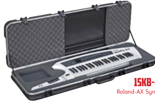
1SKB-44AX Roland-AX Synth Case