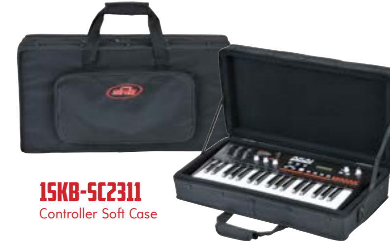
1SKB-SC2311 Controller Soft Case