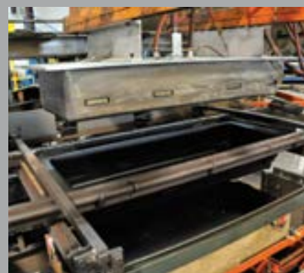
Vacuum mold for keyboard case.

In 1997, SKB invested in roto-mold machinery that is ideal for making larger cases and cylindrical cases. The PE roto-mold material starts as a fine powder that is measured according to the size of the case. The material is then sealed up in a multi-piece aluminum mold and fixed on a biaxial rotating wheel. The material is heated at 800 degrees in a very large oven while constantly rotating. The powder melts and coats the inside of the mold and after cooling, the cast is disassembled and the case is removed. Roto-Molding is great for providing maximum protection and can withstand maximum impact in transport.