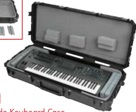
3i-4719-TKBD iSeries 61-Note Wide Keyboard Case - with Think Tank Interior