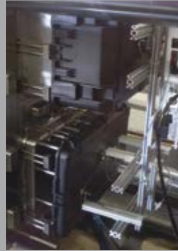
One of our Injection Molders in action