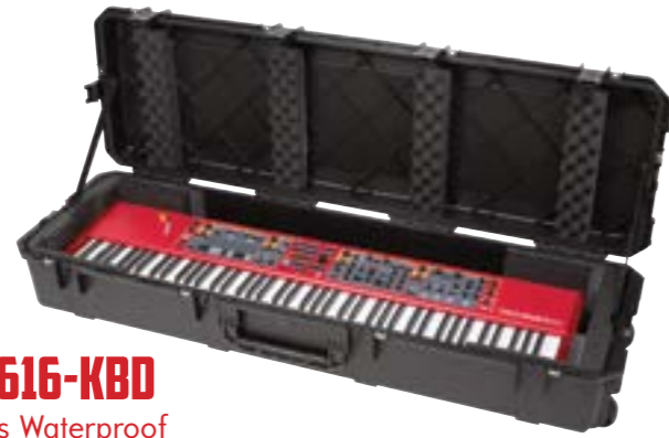
3i-5616-KBD iSeries Waterproof 88-Note Keyboard Case