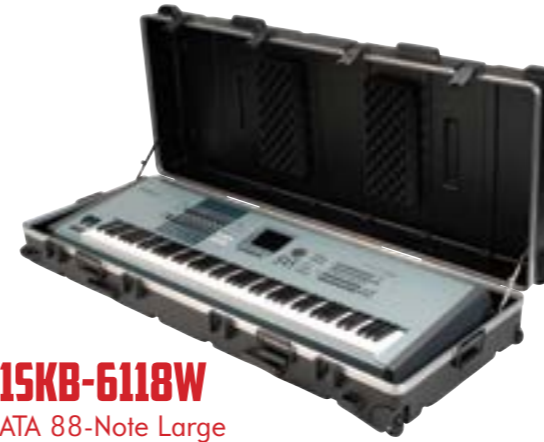
1SKB-6118W ATA 88-Note Large Keyboard Case